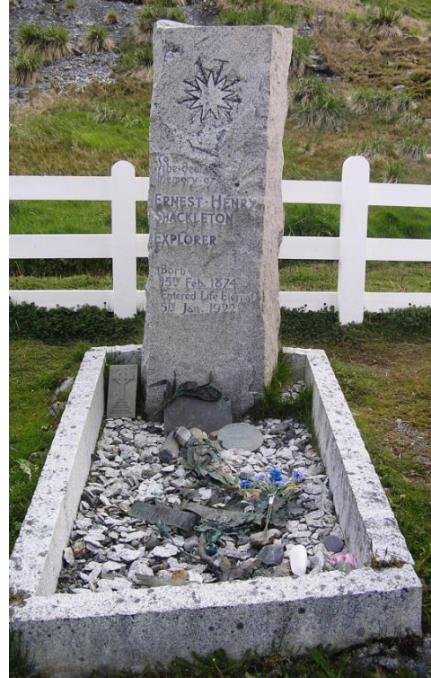
Sir Ernest Shackleton's grave stands at the edge of Grytviken, South Georgia.

With their ship lost and supplies drastically limited, the men used sleds and tiny boats to cross over treacherous stretches of ice—sometimes moving from iceberg to iceberg. When they finally reached stable ground, only Shackleton and five other men sailed across the wildest open ocean on the planet in what amounted to a covered rowboat with makeshift sails. He hoped that the prevailing current might land them on South Georgia, something like facing away from a dartboard across the room, throwing the dart backward over the shoulder without looking, and expecting to hit the bull’s eye—three times in a row. Shackleton eventually reached the far side of South Georgia just as a hurricane hit, faced down a wave first thought to be a mountain in the distance, landed ashore, crossed a mountain range at the time believed impassable, found help, and then returned to Antarctica to save the remainder of his stranded crew. When he died many years later, he was buried here. This monument to him was without question well deserved.