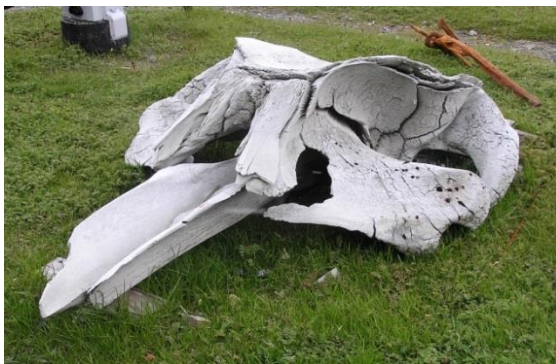
The Sun and wind weather a giant whale skull.

I didn’t intend to take so many photographs at a place like this. But I was infuriated and could not let these affronts go unchallenged. So I took photographs of harpoons, of launchers, of lances, of spears, of sickles, of gaffes, of hooks, of barbs, of winches, of cranes, of rollers, of cable, of chains, of belts, of compressors, of conveyors, of shovels, of scoops, of dollies, of carts, of boilers, of incinerators, of vessels, of tanks.