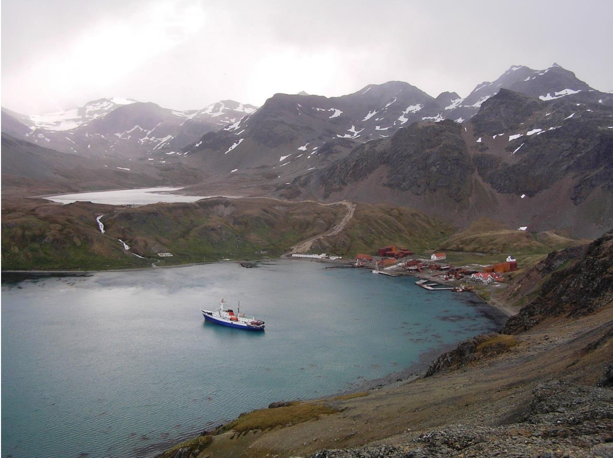
The M/V Ushuaia, formerly a NOAA research vessel, anchors in the harbor of the abandoned Grytviken Whaling Station in South Georgia.

So, just how many whales does Japan have to kill decade after decade to finally come up with the results of their study? Think about the cost to run such a study, traveling so far year in and year out in their massive, specially designed specimen gathering ships. The Japanese must have had very gracious and very patient sources funding this science. A look at the truth revealed that the scientific study conducted by the Japanese amounted to nothing more than taste tests. Somehow, year after year after year, scientific specimens, a.k.a. whale meat, ended up in the grocery stores in Japan. Their science was absolute bunk and a blatant sham. Scientific results should not be published on the pages of restaurant menus.