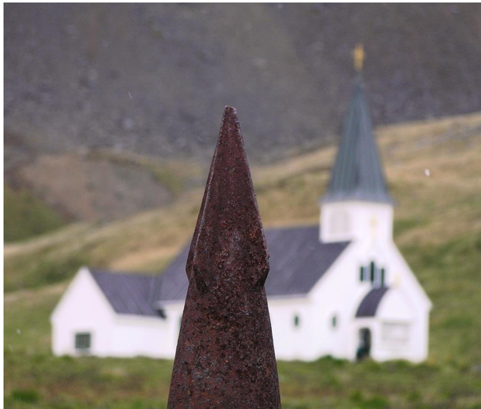
A harpoon tip and church steeple share a pattern.

This whaling station operated from 1904 to 1965. The first airplane flew only one year before it opened, and men had been flying to space for four years already before it closed. I needed to be alone with my thoughts for a while. The Zodiacs were leaving soon. But back on the ship where could I find a place to be by myself when I had a roommate and every other square inch seemed to be occupied by someone else?